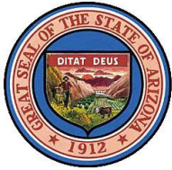
Douglas A. Ducey GOVERNOR