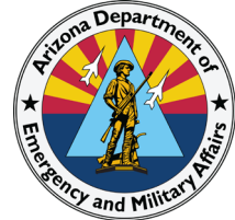
Major General Kerry L. Muehlenbeck THE ADJUTANT GENERAL

5636 East McDowell Road Phoenix, Arizona 85008-3495 (602) 267-2700 DSN: 853-2700