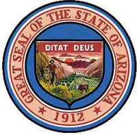
Katie Hobbs GOVERNOR