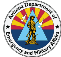
Major General Kerry L. Muehlenbeck THE ADJUTANT GENERAL

5636 East McDowell Road Phoenix, Arizona 85008-3495 (602) 267-2700 DSN: 853-2700